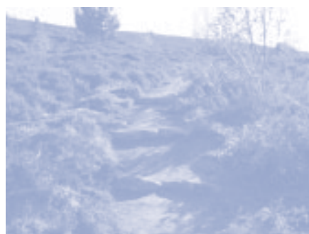
Scolty Path Repair.