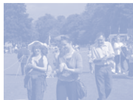
St Ternan's Heritage Fair - Ferret Competition.