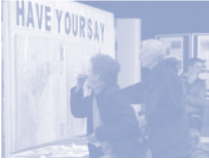
Have Your Say.