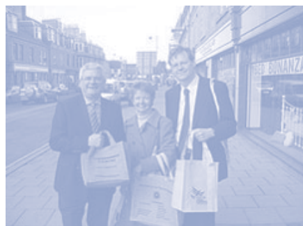
Banchory Bags Campaign.