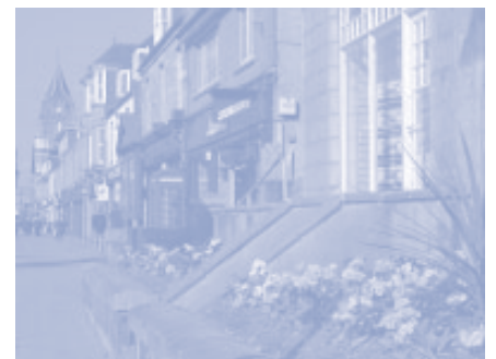
Banchory High Street.