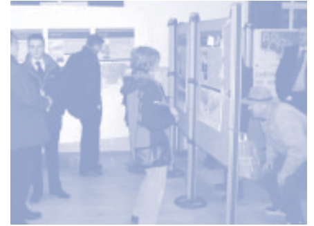
Making it Real.

There is concern that volunteer groups working on behalf of the community (BCC, BDI, Banchory Business Association) are struggling to gain active membership.