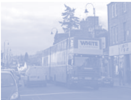
High Street Traffic.