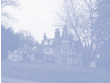
Bellfield Retirement Home.