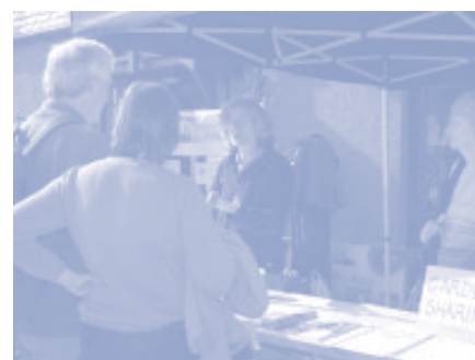
Farmers Market Community Stall.