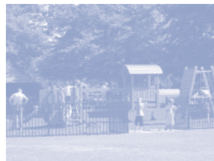
Bellfield Park Play Area.

A new swimming pool is desired as part of the HOB Leisure Centre. BDI is cooperating with Bandswim in ongoing discussions with Aberdeenshire Council and North Banchory Company to resolve the viability of a swimming pool as part of a leisure complex at Hill of Banchory.